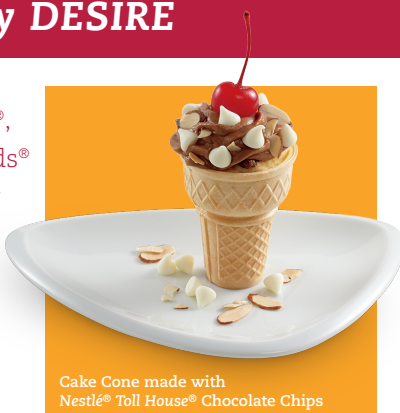
Cake Cone made with Nestlé® Toll House® Chocolate Chips

Nestlé Butterfinger®, Crunch®, Toll House®, and Wonka® Nerds® confections and chocolates offer classic comfort with the brands students grew up with. Perfect for dessert customization and encouraging creativity that speaks to their cravings.