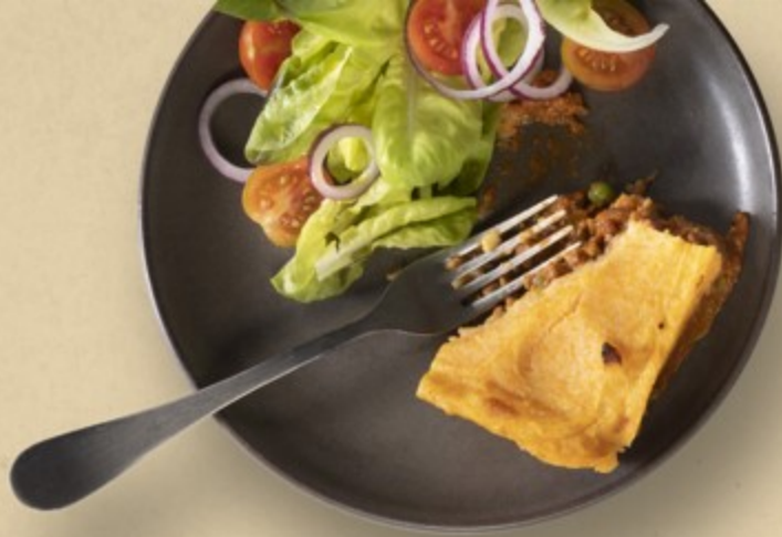
Plant-based Shepherd's Pie