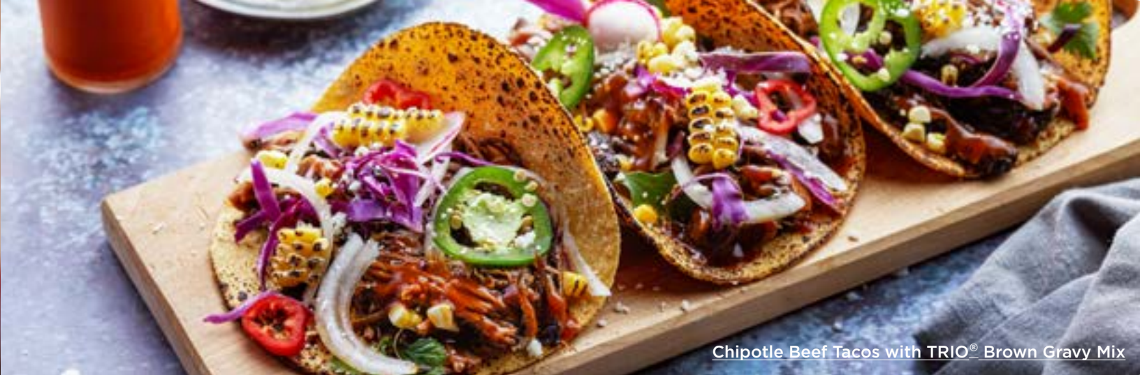
Chipotle Beef Tacos with TRIO® Brown Gravy Mix