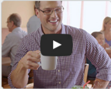
Beverage Trend Watch: Customized Beverage Solutions for Your Business