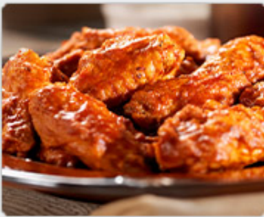
Food Trend Watch: Classics: How to Create Signature Wings and Nuggets