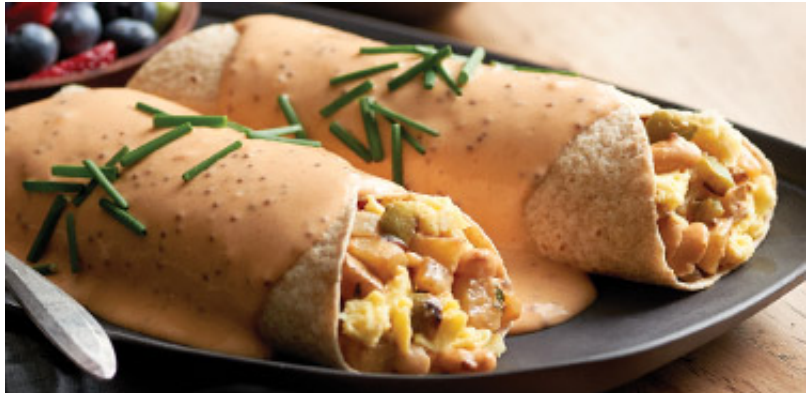
Potatoes O'Brien Smoky Cheese Breakfast Enchiladas