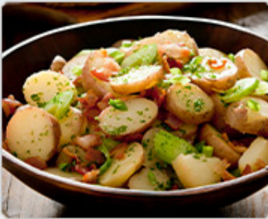
Food Trend Watch: Discover 9 Hot Trends for Sides