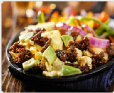
Food Trend Watch: Globalize Your Breakfast Menu