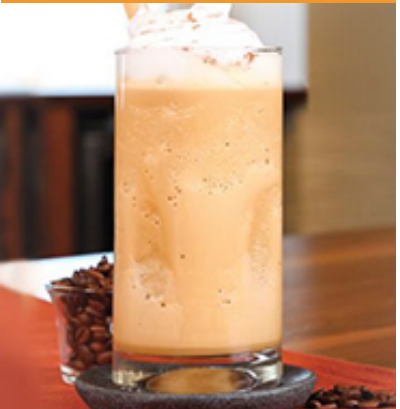
Horchata Mocha Frappé